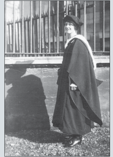
Right: One of Oxford's first female graduates, Cicely Delphine Williams of Somerville College, Oxford, 1920. She became a world-renowned physician.